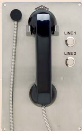
GB59VAH-LH (Less housing)